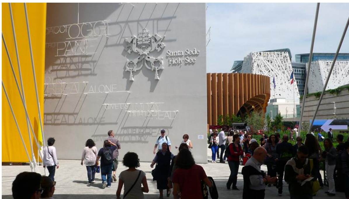
The Holy See Pavilion, Universal Exhibition Expo Milan 2015

Only five writings are now available: 2 French, 2 Russian, 1 Polish. www.ilviaggiodellaparola.it www.ginettecaron.it